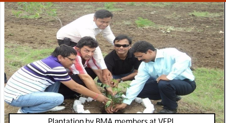
Plantation by BMA members at VEPL